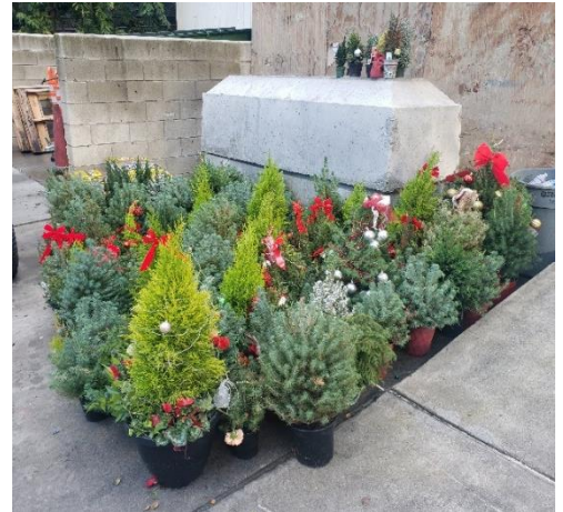
Here are just a few of the trees adopted by Shadetree Partnership from El Toro Memorial Park.

If you have a love of plants and a desire to be a part of this wonderful