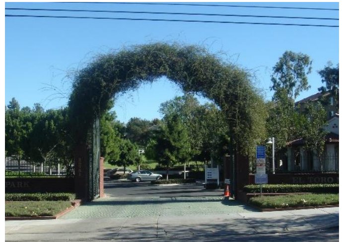
The El Toro Memorial Park Front Gate Before and After

During work on the front gate, access to El Toro Memorial Park was only available through the rear gate. We apologize for any inconvenience or confusion that that