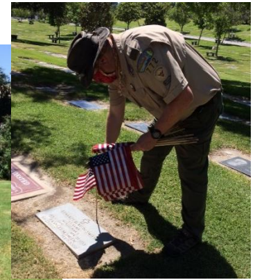
Scouts and adult leaders from Boy Scout Troop 772 of Laguna Niguel set flags at El Toro Memorial Park.