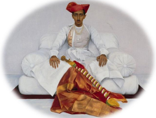
The Maharaja of Indore, Santa Ana’s richest resident is pictured above. He is one of many fascinating personalities you will meet on the tour.

This event is an exciting and fun glimpse into the past! Small groups, a lovely outdoor setting, and close access to the actors make the tour an entertaining outing for the whole family. For more information or to purchase tickets, please visit www.SantaAnaHistory.com or contact the Preservation Society at (714) 547-9645.