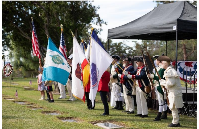
Members of the California Society, Sons of the American Revolution; South Coast Chapter – Mullan’s Marines; Orange County Chapter – Lee’s Legion; and the Mission Viejo Chapter, NSDAR formed a combined color guard for the program.

Please mark your calendars for our Memorial Day Programs which will take place at all three District cemeteries on Monday, May 29, 2023. Santa Ana Cemetery’s program begins at 10:00 a.m. Anaheim Cemetery and El Toro Memorial Park Programs begin at 11:00 a.m. We hope to see you there!