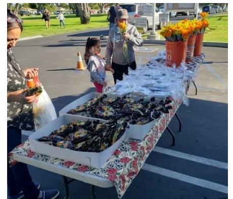
A gravesite Ofrenda (above) Dia de los Muertos "To Go" at Anaheim Cemetery in 2021