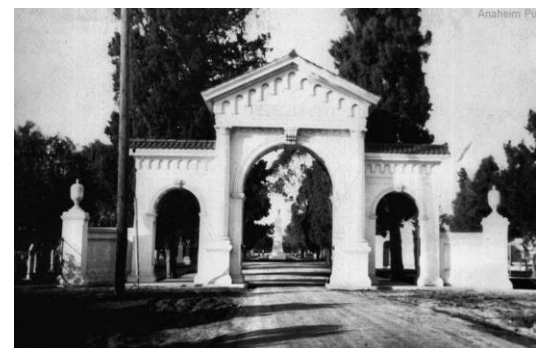
The historic Pioneer Memorial Archway was once the grand entrance to the cemetery grounds.

The tour is open to all but space is limited. Please RSVP by calling (714) 904-6725. A suggested donation of $10 per person is greatly appreciated. This tour is brought to you by the Anaheim Historical Society.