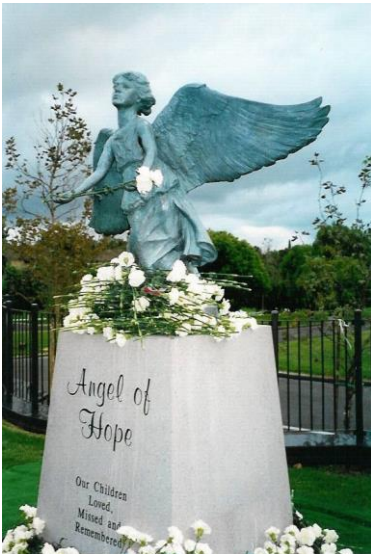
The Angel of Hope Statue at El Toro Memorial Park, enveloped in flowers the morning after the annual candlelight memorial service.

Twenty years ago, on September 28, 2002 the Angel of Hope Statue, pictured left, was dedicated at El Toro Memorial Park. Written on the granite base are the words, “Angel of Hope, Our children loved, missed and remembered.” Bricks adorn her base inscribed with the names of children who have not been forgotten.